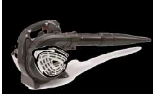
ABL 27 Air Blower