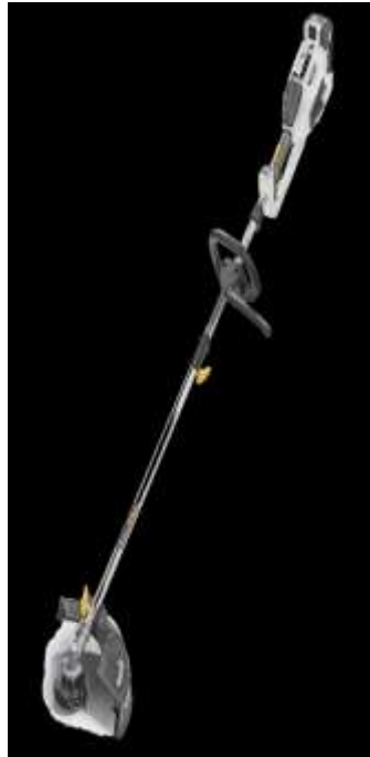
B 3548 Li Brushcutter