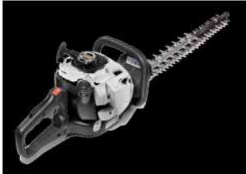
H 60 Hedge Trimmer