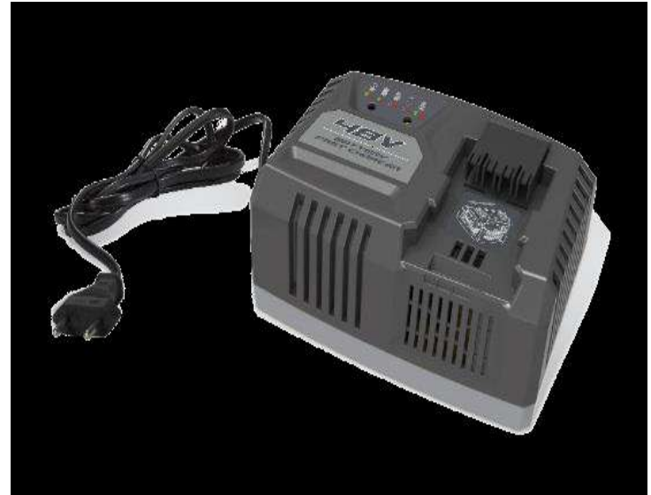
48v Fast Charger EU plug