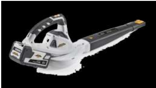
BL 548 Air Blower