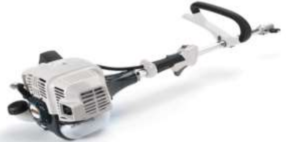
MT 26 5in1