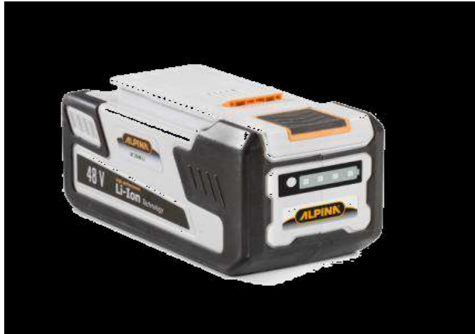
48v Power Units Battery